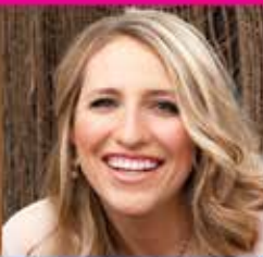
LAURA STORY Musician