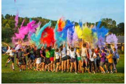
Rooted to Belong : men, ushers, and students gathering and connecting as groups